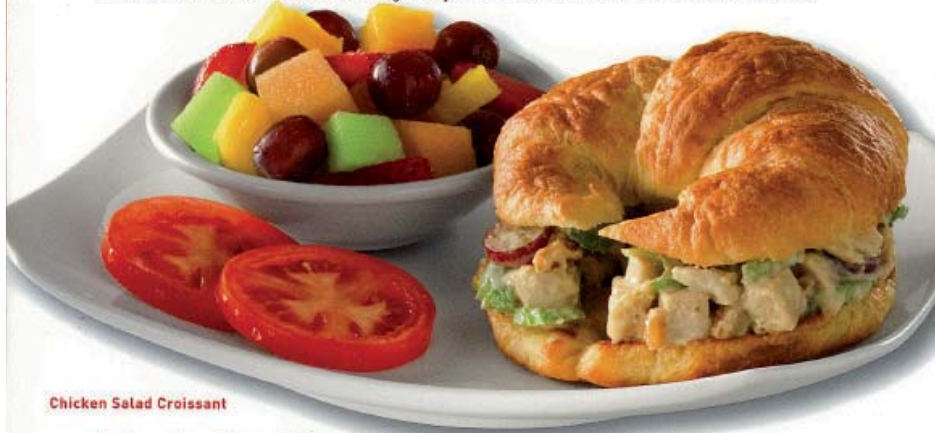
Chicken Salad Croissant

NEW Tuna Salad Croissant Fresh all-white Albacore tuna salad served on a flaky toasted croissant with lettuce and tomato, along with your choice of a bowl of fruit or French fries. 6.49