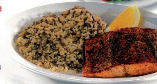
"Wild-Caught" Pacific Salmon