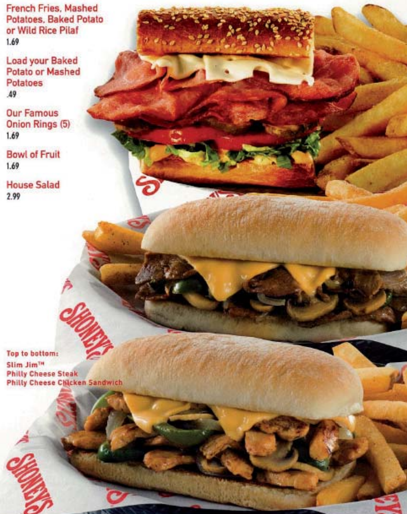
Top to bottom: Slim Jim™ Philly Cheese Steak Philly Cheese Chicken Sandwich