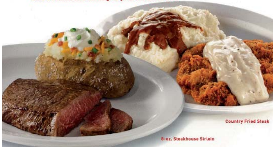
Country Fried Steak

Load your baked potato or mashed potatoes for .49. Add 4 butterflied shrimp to your steak for 2.99.