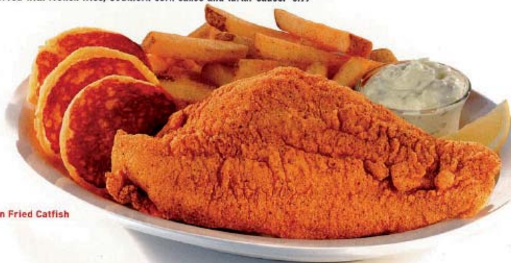
Southern Fried Catfish

A farm-raised catfish fillet breaded in traditional, seasoned cornmeal breading. Served with French fries, Southern corn cakes and tartar sauce. 8.99