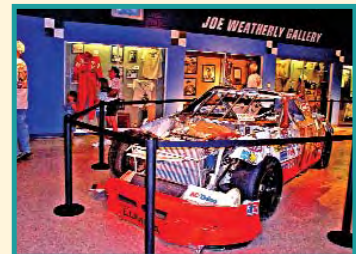
Darlington Raceway Museum