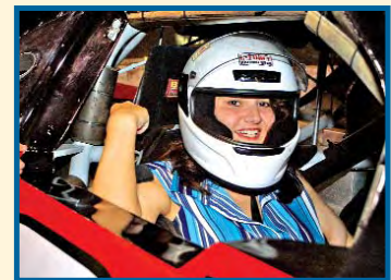
Experience real race track speed.