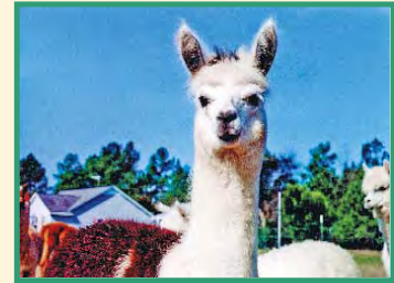
Sassy the alpaca