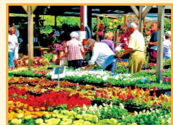
Pee Dee State Farmer's Market