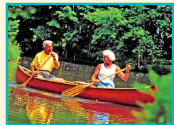
Canoeing Lynches River

* Member ABA, FMA, GMOA, MASC, NCMA, NTA, PBA, SCMA, STS, UMA, VMA