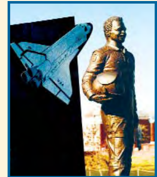
Dr. Ronald McNair Memorial