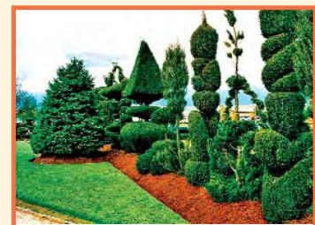
Fryar's Topiary Garden