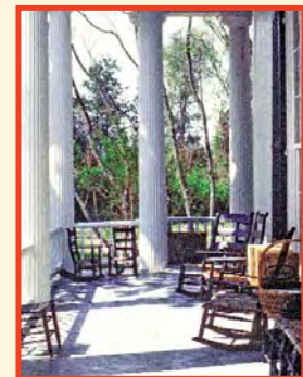
The Columns Plantation