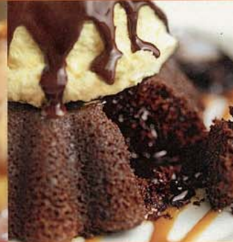
Molten Chocolate Cake