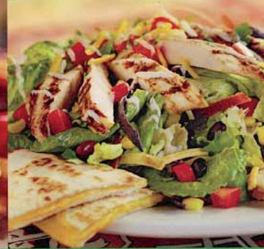
Quesadilla Explosion Salad