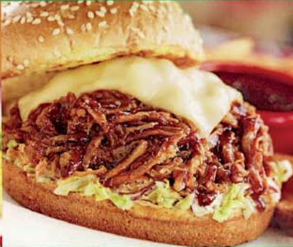
BBQ Pulled Pork