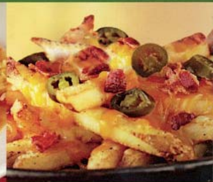
Texas Cheese Fries