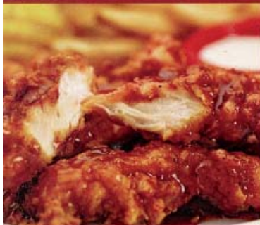
Crispy Honey-Chipotle Chicken Crispers*

Crispy Shrimp Three flour tortillas with tomatoes, cheese, lettuce, honey-chipotle drizzle and ranch dressing. Served with rice and black beans. 9.99