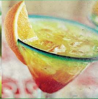
Tropical Sunrise Margarita