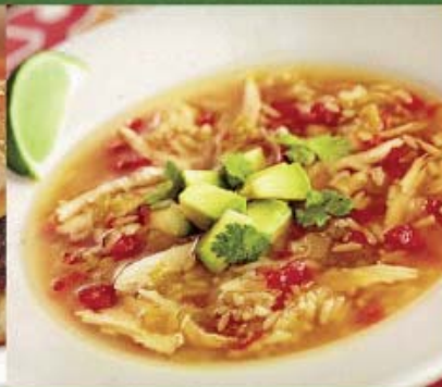
Chicken & Green Chile Soup