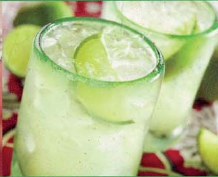
World's Freshest Margarita